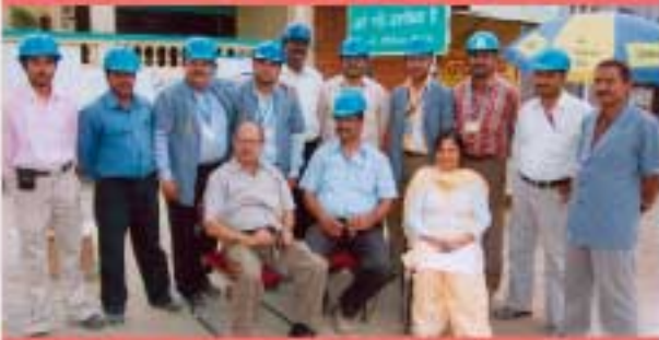
The ADB officials at Bhopal site

The purpose of the visit was to study the best practices in Asian Development Bank (ADB) project Works. Since, Madhya Pradesh was rated first in project quality and progress among all ADB projects in India, the officers from North East zeroed on it for a quality visit.