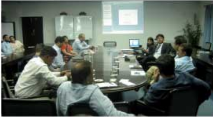
Workshop at Dimna

"As a part of continuous learning and to address legal issues related to projects, the second interactive one day workshop by Amarchand Mangaldas, one of the leading most law firms of India was organised by Legal Department of JUSCO on 30th March, '09 at Dimna .